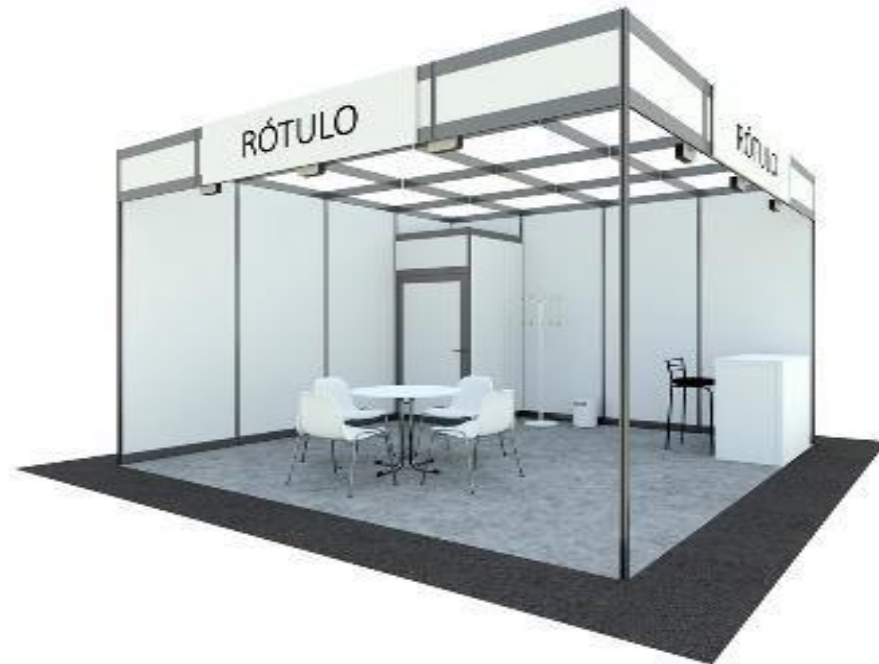
Turnkey "all-inclusive" stand Modular BASIC