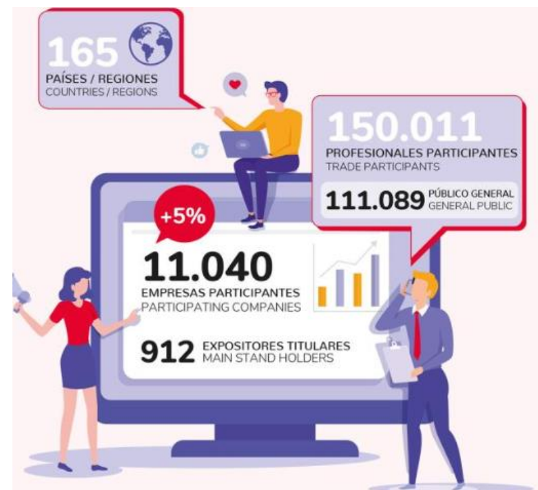
Fitur 2020 figures

Come to FITUR FESTIVALS and present your offer to the world tourism industry in its great fair.