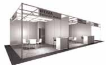
BASIC Stand Design for information purposes only